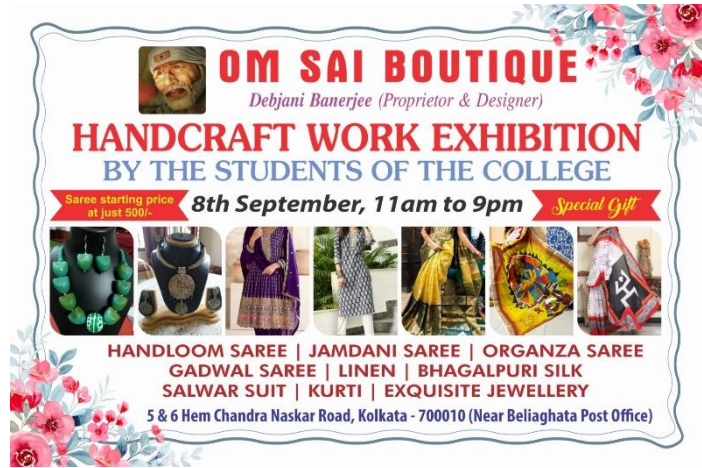
RCEC arranged to organize Handcraft Work Exhibition