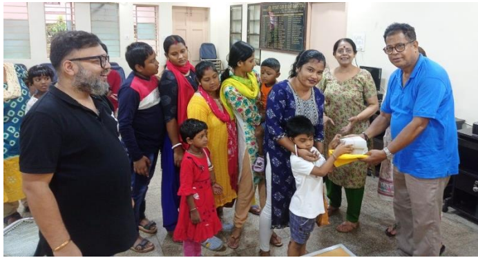
Organized Flagship project Nabadisha: Health Checkup Camp for Mother and Child at Rotary Bhaban on 15th September 2024 Project/Event 04: Distribution of educational kits