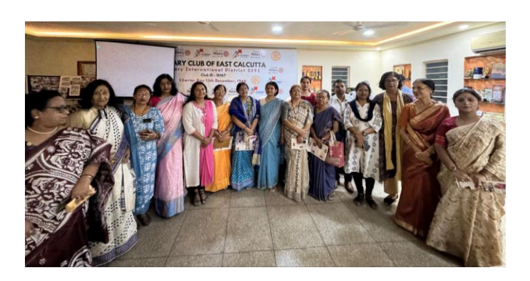
Project/Event 03: Nabadisha: Medical Camp of Mother & Child at Rotary Bhaban on 15th September 2024

4th September 2024 7 PM onwards Rotary Bhawan, Beliaghata