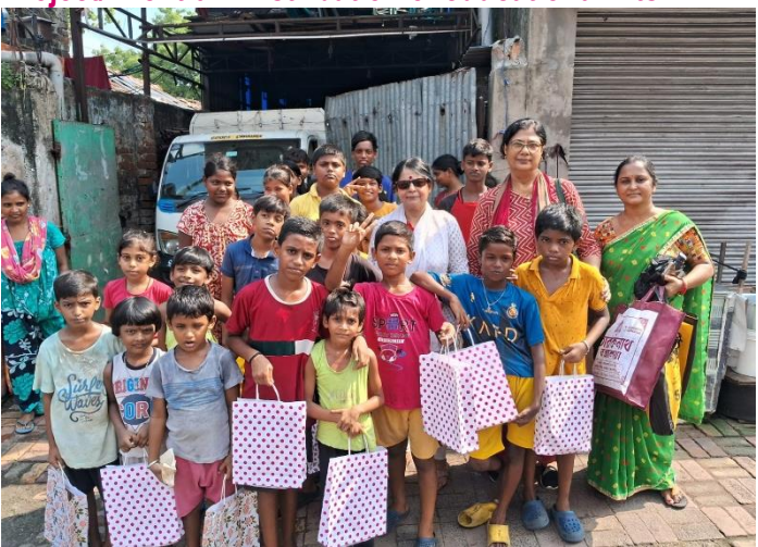
Distributed educational kits to the underprivileged students on 20th September 2024.