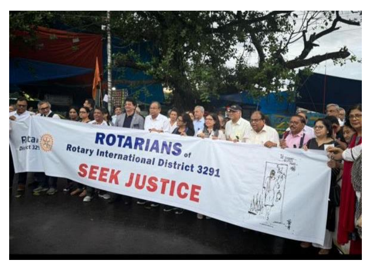
Rotarians SEEK JUSTICE